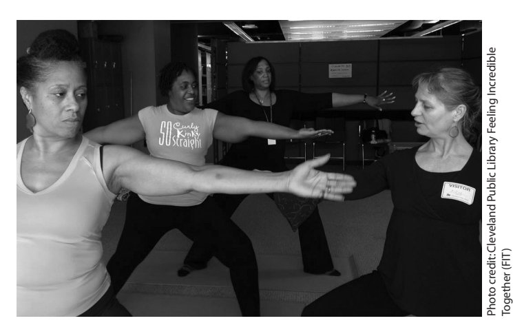
Cleveland Public Library employees engage in wellness activities.

Since the health-care changes are still newly implemented, the City of Independence doesn't have information on savings yet, though Lubin estimates that they have saved two to three percent in health-care premiums from changes to the plan design. But members of the committee have already undergone changes from the wellness program—some losing 40 to 50 pounds. According to Lubin, "What's most exciting is that people have taken ownership of certain pieces of it. Members of the police department are...researching motion bracelets. From an HR perspective, it makes my life so much easier to have advocates out there speaking the same language."