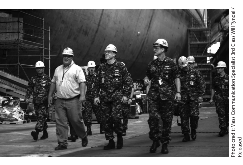
Navy officials tour the Puget Sound Naval Shipyard.

When public managers tap the firsthand knowledge of their employees, they can find ways to improve the way government runs, with obvious benefits to taxpayers, as well as to employees themselves.